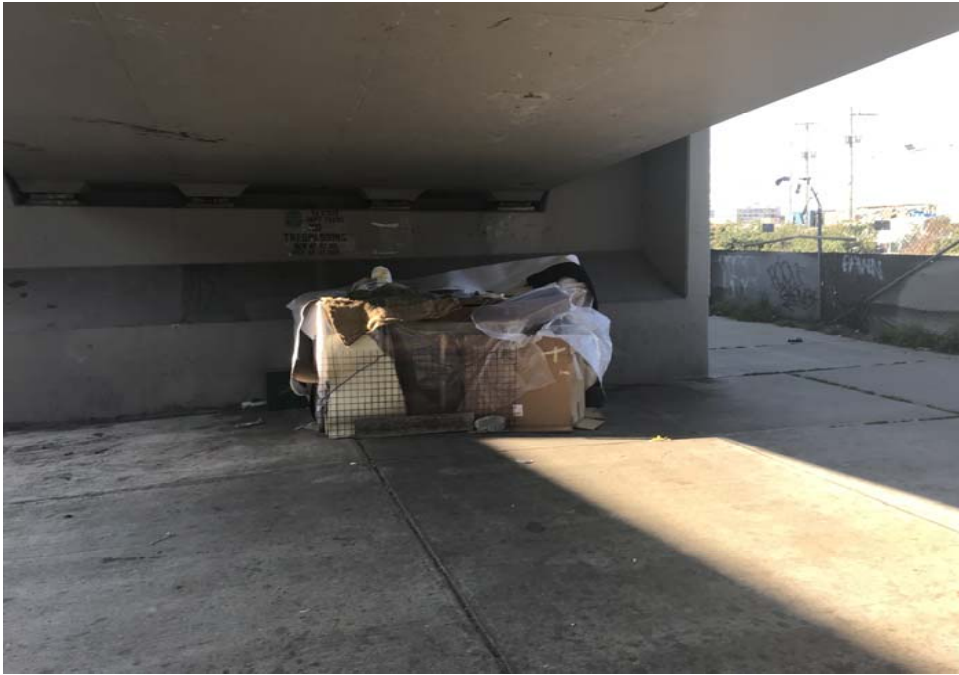
Exhibit D - Clean Up Photos